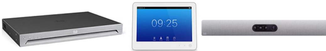
Figure 2. Cisco SX80 Integrator Package with Touch 10 and Quad Camera

With its powerful media engine, the SX80 Codec lets you build the video collaboration room of your dreams.