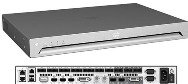
Figure 1. Cisco SX80 Codec